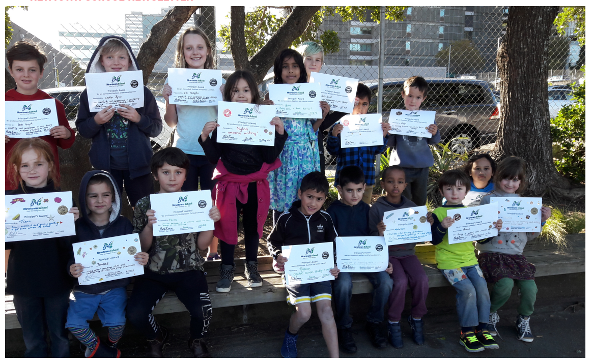
Check out our Principal Award winners from our last Whole School Assembly.