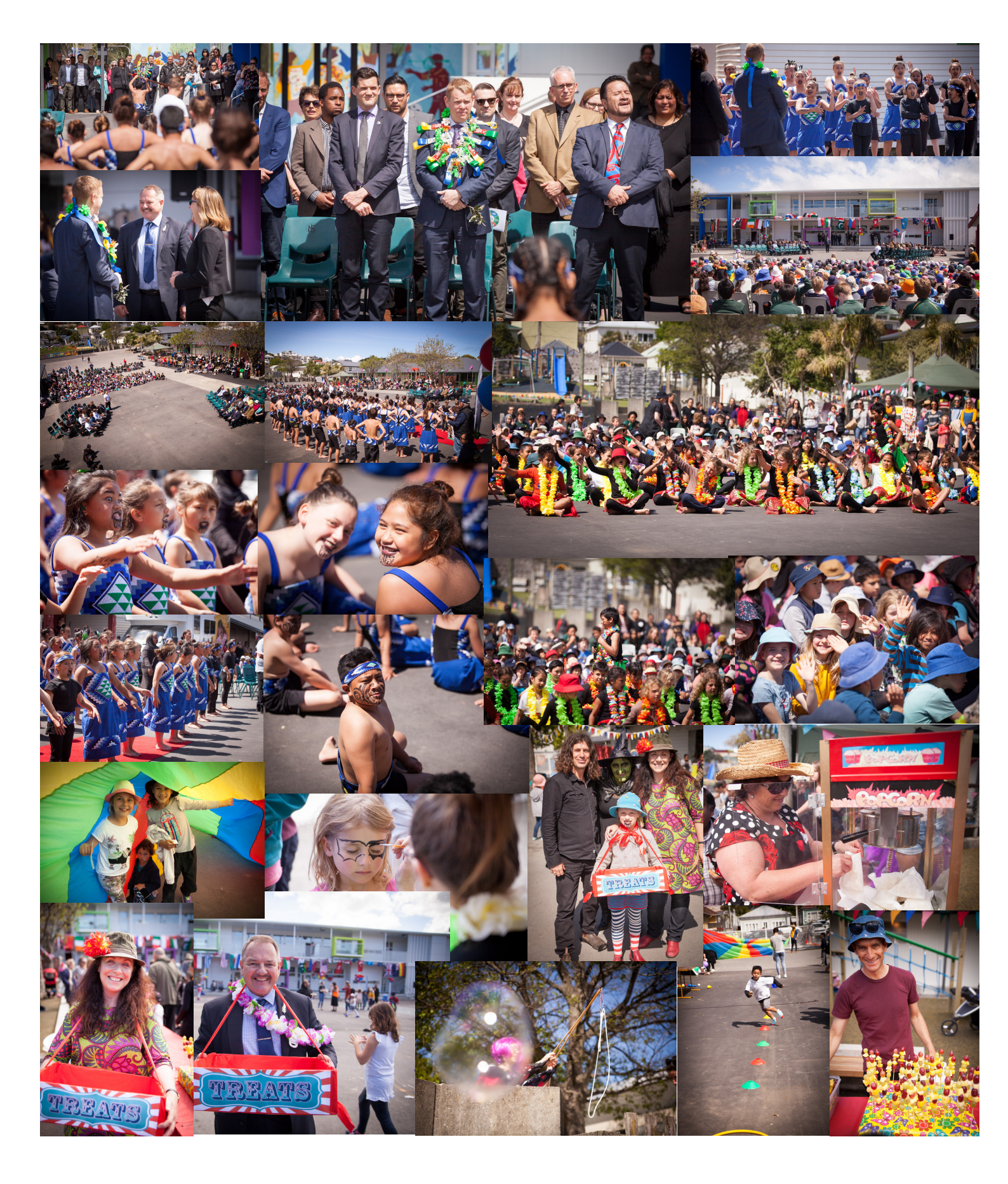
Respectful Manaaki | We value the thoughts and feelings of others

We would like to extend a big thank you to everyone who came along to our Official opening last Friday and to F@NS for all their organisation and help putting together a fabulous afternoon the kids will always remember. What a wonderful success the carnival was after the ceremony.