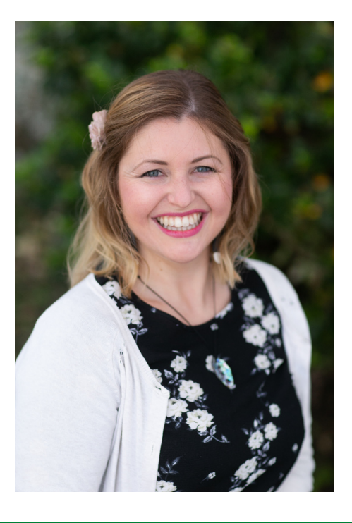
Whānaungatanga - Connected I share my culture. I value the culture of others.

I love to work with humans. Having colossal amounts of experience doing caregiving and being a support worker has opened my mind. It has enhanced my interest to learn about how different and unique we all are. I'm really looking forward to working with all students and staff at Newtown School.'