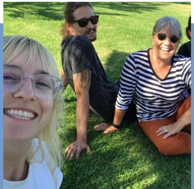
Visiting my children in Victoria

Outside of work I enjoy making the most of what Wellington has to offer on the nature front, love cooking up a storm for whoever wants to come and join us and saving up to visit our adult children who both live in Australia.