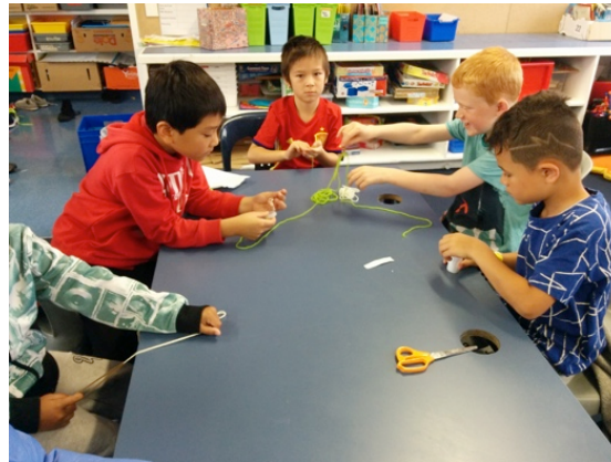
Constructing a lever machine.