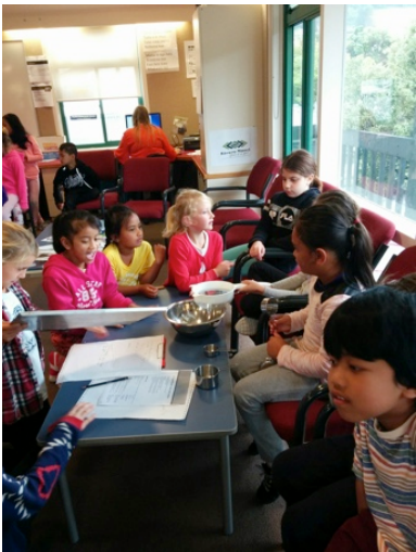
A team bake...