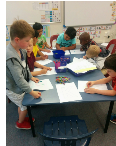
Active writers and thinkers.