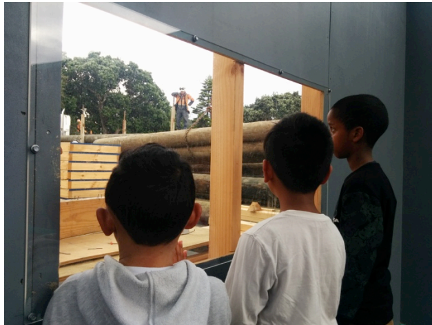
Watching the construction.