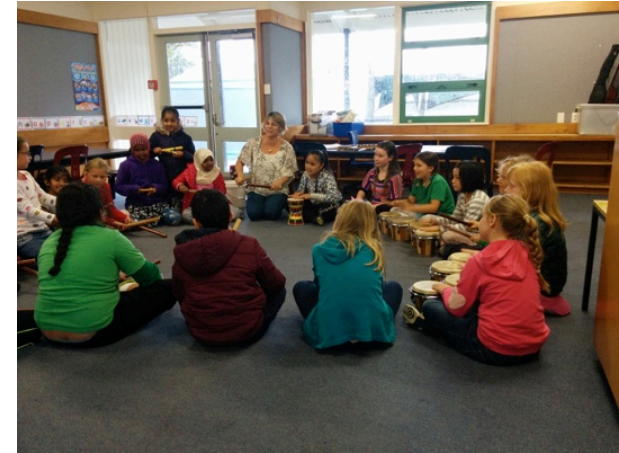
Creating a rhythm and beat with Nicki...