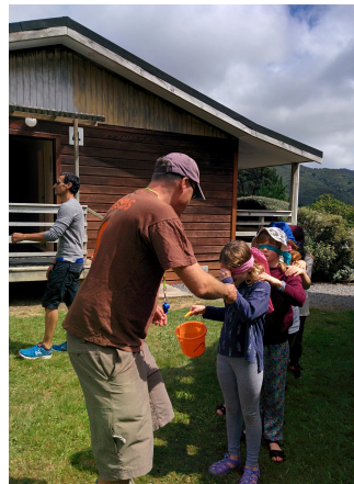
Leadership training at Camp Wainui.