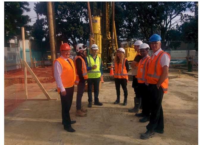
Site management and project team.